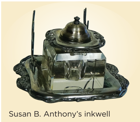
Susan B. Anthony's inkwell

The first priority of this fund will be to generate a perpetual stream of income for the ongoing restoration, monitoring, maintenance, and conservation of the National Susan B. Anthony Museum & House's historic properties and permanent museum collection. This will prevent the pattern of restore/neglect that so often afflicts historic house museums.